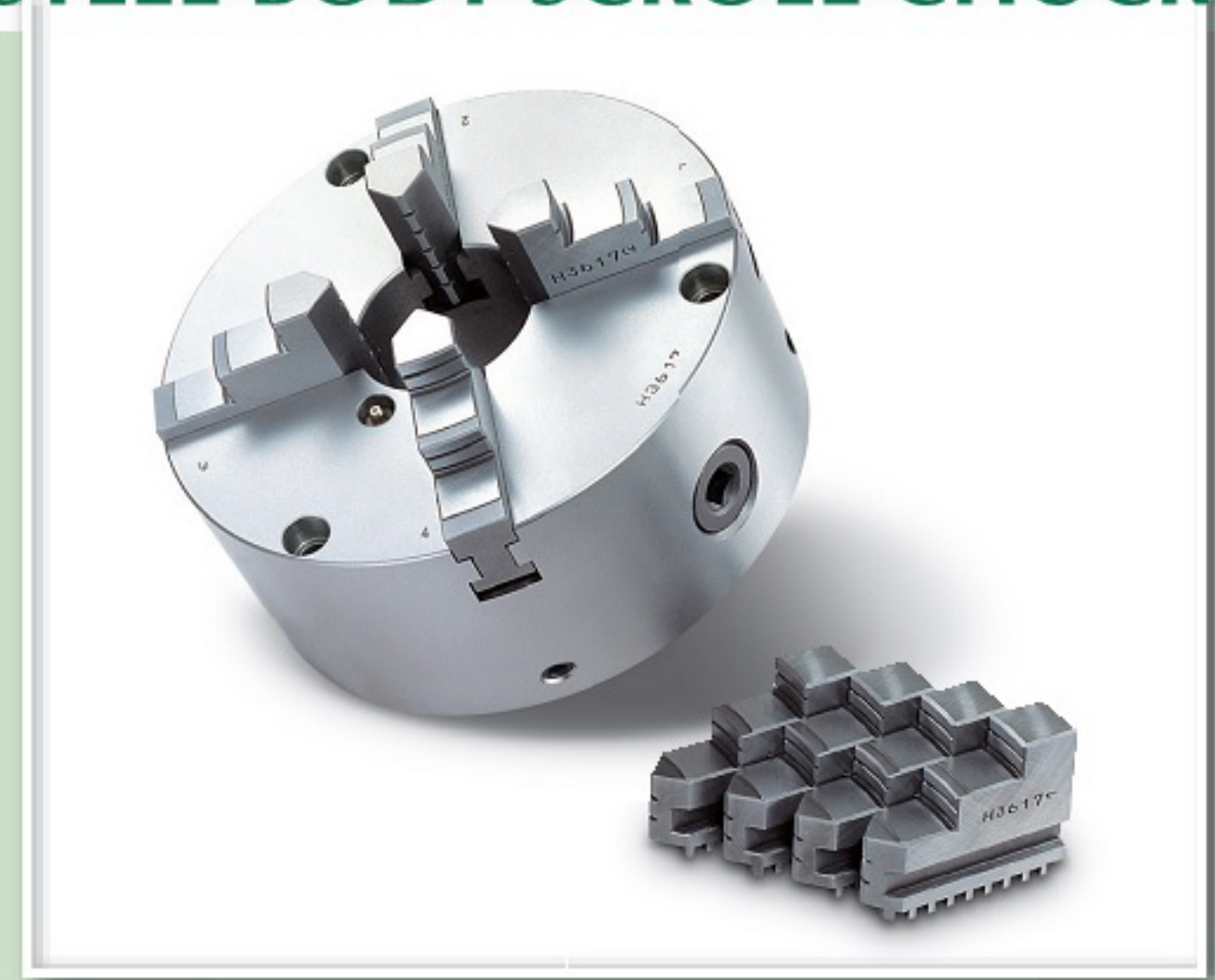
規格表 » Specifications